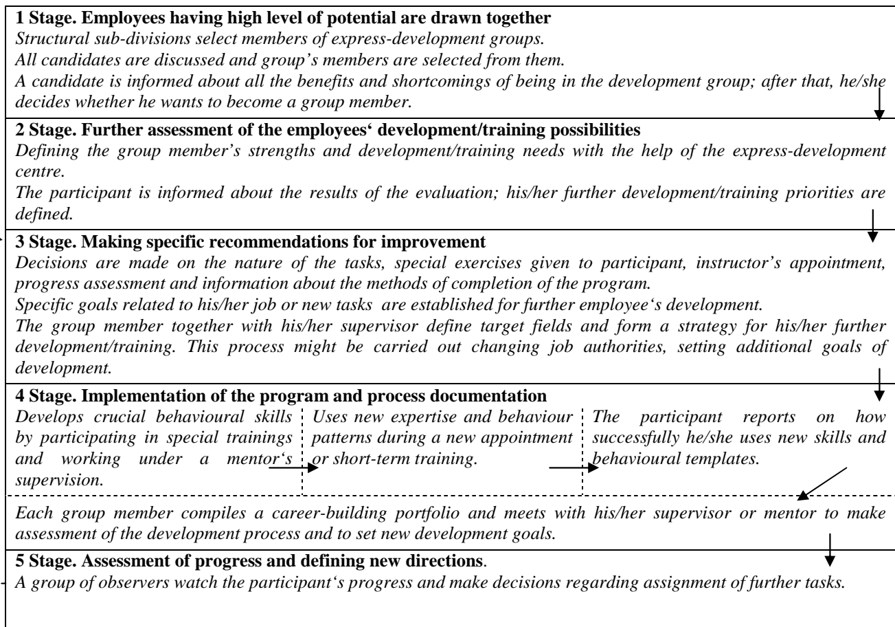
Figure 2. A model of managers' skills development