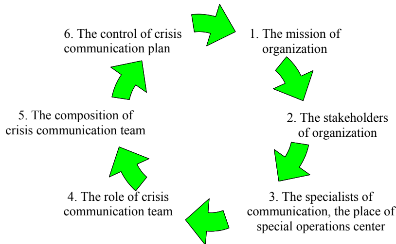
Figure 3. The Model of Crisis Communication Plan (adapted from Turney, 2007)

According to Turney (2007), crisis planning is like buying insurance. Once you have decided to buy insurance or to prepare a Crisis Communication plan, another sensible precaution is to prepare for the worst case