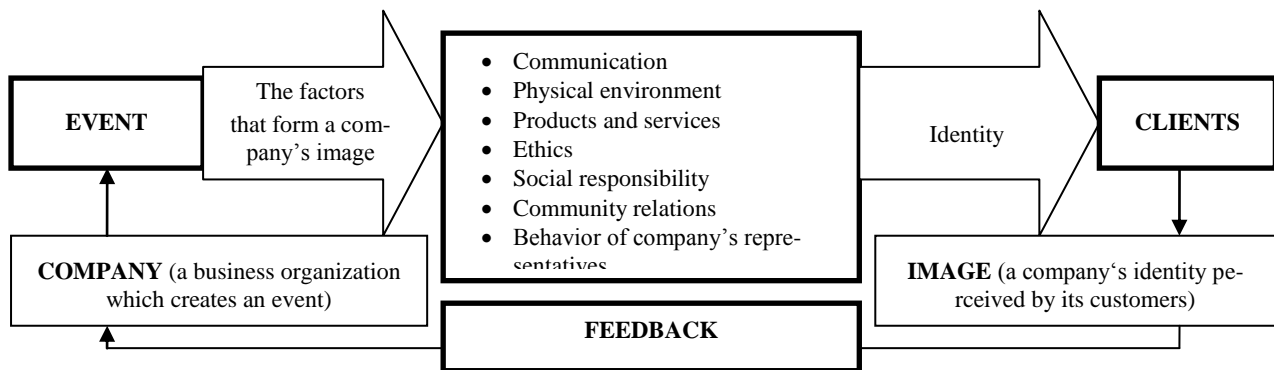
Figure 2. The system of interaction between an event and company's (product's) image Created by the authors, 2007

The research carried out by the authors enables them to form the system of interaction between an event and company's (product's) image (Figure 2).