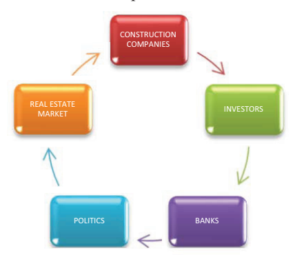
Figure 1. Dependence of the real estate market

As early as in 1993, Shiller (2003) warned that, due to poor protection of real estate prices in the past, their future decline would cause concern among owners. He also said that in the future real estate prices started to decline.