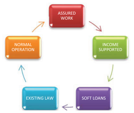
Figure 2. Real estate market before the financial crisis

Because then the stable situation in the housing market and 18-years constant annual growth of property prices, unfortunately experts, investors, owners, construction companies, economists and politicians have not devoted attention to factors that affect on property prices.