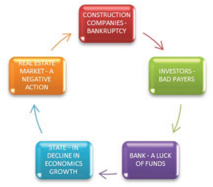
Figure 3. Real estate market in financial crisis

In 2008 it was detected first downs in property prices. House prices have dropped significantly until 2011. As the construction industry has a major impact on the economy, the financial crisis occurred, pronounced that no one expected it.