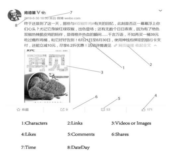
Figure 2. Brand Information Dimension Display Diagram

After determining Sina Weibo and its nine brands, a software agent is selected to collect data. The python code language is used, through setting website cookies in the program, to simulate the user login Sina Weibo. The authentication accounts of nine brands are collected, the corresponding URLs are searched, and then the official brand pages are displayed. The open source Scrapy framework is used to crawl the search results page of Sina Weibo and obtain the target data. The official brand posts and interactive information released from February 12, 2019, to July 12, 2019, are recorded, with a total of 6,409 pieces. The captured information fields include the content of each post, whether there is a link, whether there is a picture or video, the time of publication, number of shares, number of comments, number of likes and other information dimensions (see Figure 2).