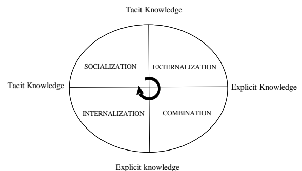
Figure 1. Four alternatives for the creation of knowledge

Thus, knowledge is created when there is the transformation of tacit knowledge of individuals into explicit knowledge at group and organizational level (Nonaka, 1994; Nonaka & Takeuchi, 1995) and each member of such groups internalize it, making it tacit knowledge again. Then we analyze the process of transforming individual knowledge into organizational. This means knowledge conversion, which is part of the spiral of knowledge. It also considers four possible modes of conversion for the two types of knowledge: socialization, externalization, combination and internalization (Figure 1).