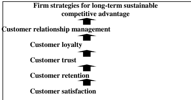
Figure 3. Management of customer satisfaction leading to long-term sustainable competitive advantage

While (Sunder, 2009) offered a framework named “Customer satisfaction leading to long-term sustainable competitive advantage”, which proved that management of customer satisfaction is a background of sustainable competitive advantage. This model could be constituted as a continuous approach of the aforementioned perception of (Sheth, 2001).